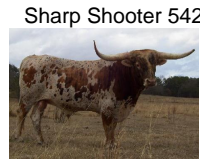
Sharp Shooter 542