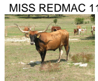
MISS REDMAC 117