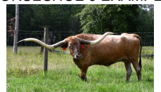
HORSESHOE J EXAMPLE