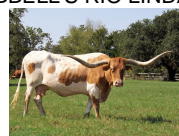
HUBBELL'S RIO LINDA TAG 2