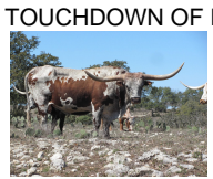
TOUCHDOWN OF RM