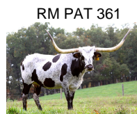
RM PAT 361