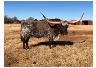
HUNTS COMMAND RESPECT