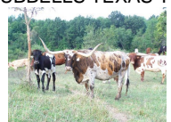
HUBBELLS TEXAS TIGER